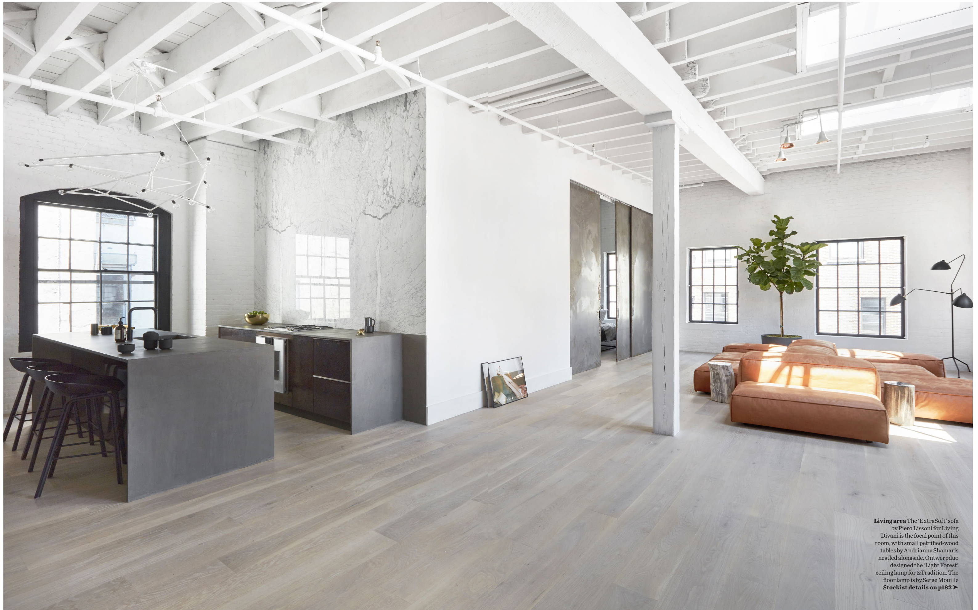
Living area The 'ExtraSoft' sofa by Piero Lissoni for Living Divani is the focal point of this room, with small petrified-wood tables by Andrianna Shamaris nestled alongside. Ontwerpduo designed the 'Light Forest' ceiling lamp for &Tradition. The floor lamp is by Serge Mouille Stockist details on p182 ►