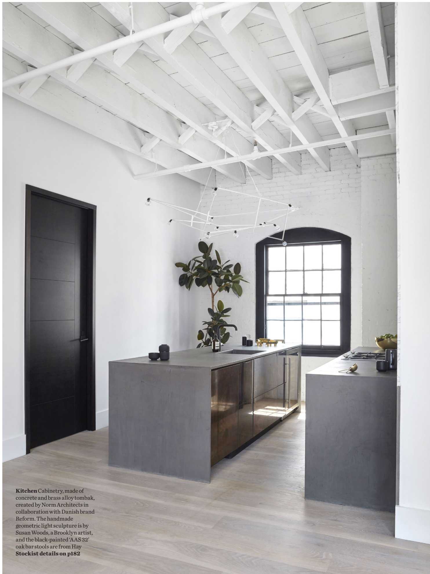
Kitchen Cabinetry, made of concrete and brass alloy tombak, created by Norm Architects in collaboration with Danish brand Reform. The handmade geometric light sculpture is by Susan Woods, a Brooklyn artist, and the black-painted 'AAS 32' oak bar stools are from Hay Stockist details on p182